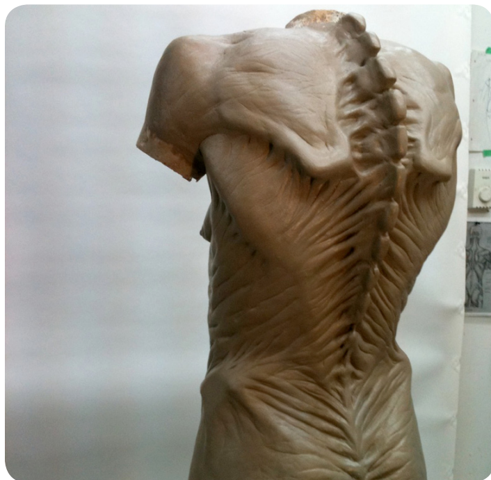
The monster prosthetic, designed by Tibor Farkas.

F says: People always say, "If you can't do it on set leave it for post." The way I see it, you shouldn't leave it to post if you know you can do it on set. A full CG shot will always look like a full CG shot—no matter how much time you spend on it. It looks too perfect. Traditional applications never look perfect. Working with